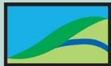
IRRIGATED CROPPING FORUM

The Irrigated Cropping Forum began life around 1990 when irrigators across the whole of the southern Murray-Darling Basin realised they must band together to identify and progress research priorities, and demonstrate cross border and national level linkages to research, if they were to be successful in seeking support from major R&D organisations. Since 1990 the ICF has held a number of triennial research forums and eventually became an incorporated body to manage funds directly.