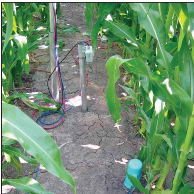
Figure 2. A soil moisture probe installed in a corn crop.