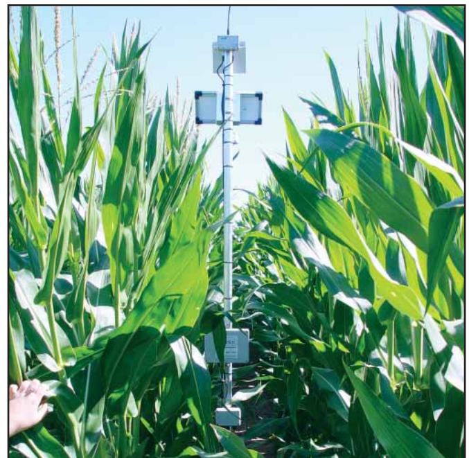
Figure 3. The componentry associated with a SMP.