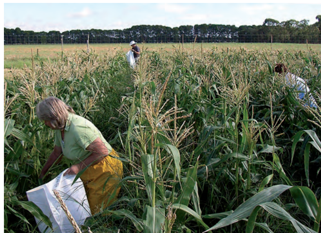
Figure 1. Staff at Yanco Agricultural Institute harvesting the 2007–08 sweet corn efficacy trial

There has been a series of major national research projects aimed at managing pests of sweet corn in Australia. The research has focused on Helicoverpa grub control and the increasing pressure of secondary pests. Much of the research has now been completed with the last of the trials winding up this season. The series of research projects has been led by Queensland Department of Primary Industries and involved agencies from most other states in Australia including researchers from Yanco Agricultural Institute. Some of the outcomes achieved from the research projects include a significant contribution towards the registration of new biological and narrow spectrum insecticides, developing Integrated Pest Management systems (which utilise pest monitoring and beneficial insect activity) and developing