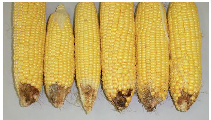
Figure 4. Sweet corn cobs with Helicoverpa grub damage