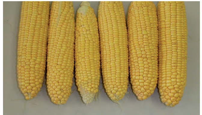
Figure 3. Sweet corn cobs that have no damage from insects

Tony Napier District Horticulturist NSW Department of Primary Industries, Yanco Agricultural Institute T: 02 6951 2796 M: 0427 201 839