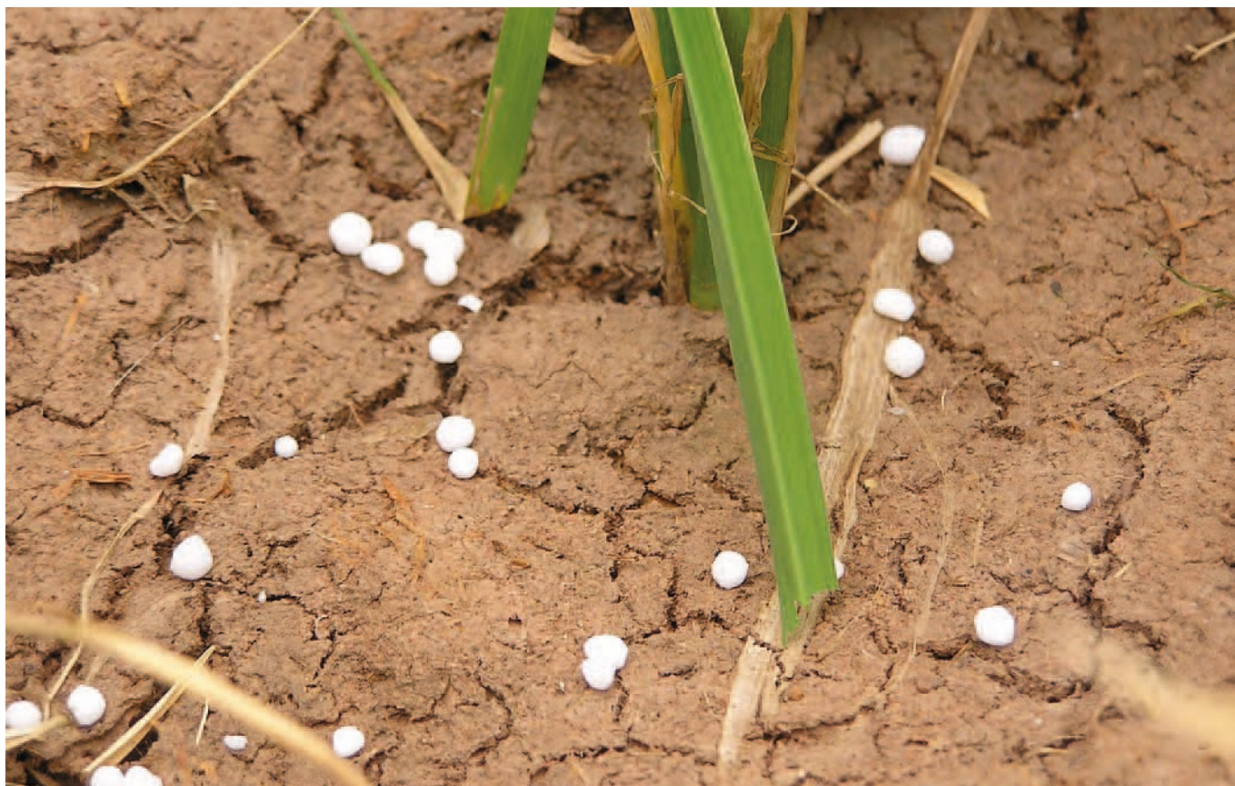
Applying urea to the dry soil surface prior to applying permanent water is a very efficient nitrogen practice for drill sown rice. The applied water will dissolve the urea and wash it into the soil where the nitrogen fixes to the clay particles.

Recent research has shown that in many soil types applying extra nitrogen to deep cut soils, without sufficient phosphorus being available, will not increase grain yield. Heavy cut areas have very low levels of phosphorus as most of the phosphorus was in the topsoil that has been removed. These soils also have a higher soil pH which limits phosphorus availability to the rice plant when the field is flooded. We suggest that for cuts greater than 10 cm, apply extra phosphorus each year for up to five years. In some cases an extra 30 kg/ha of phosphorus is needed to achieve a high yield potential. For deeper cuts apply higher rates of phosphorus and for a longer period of time.