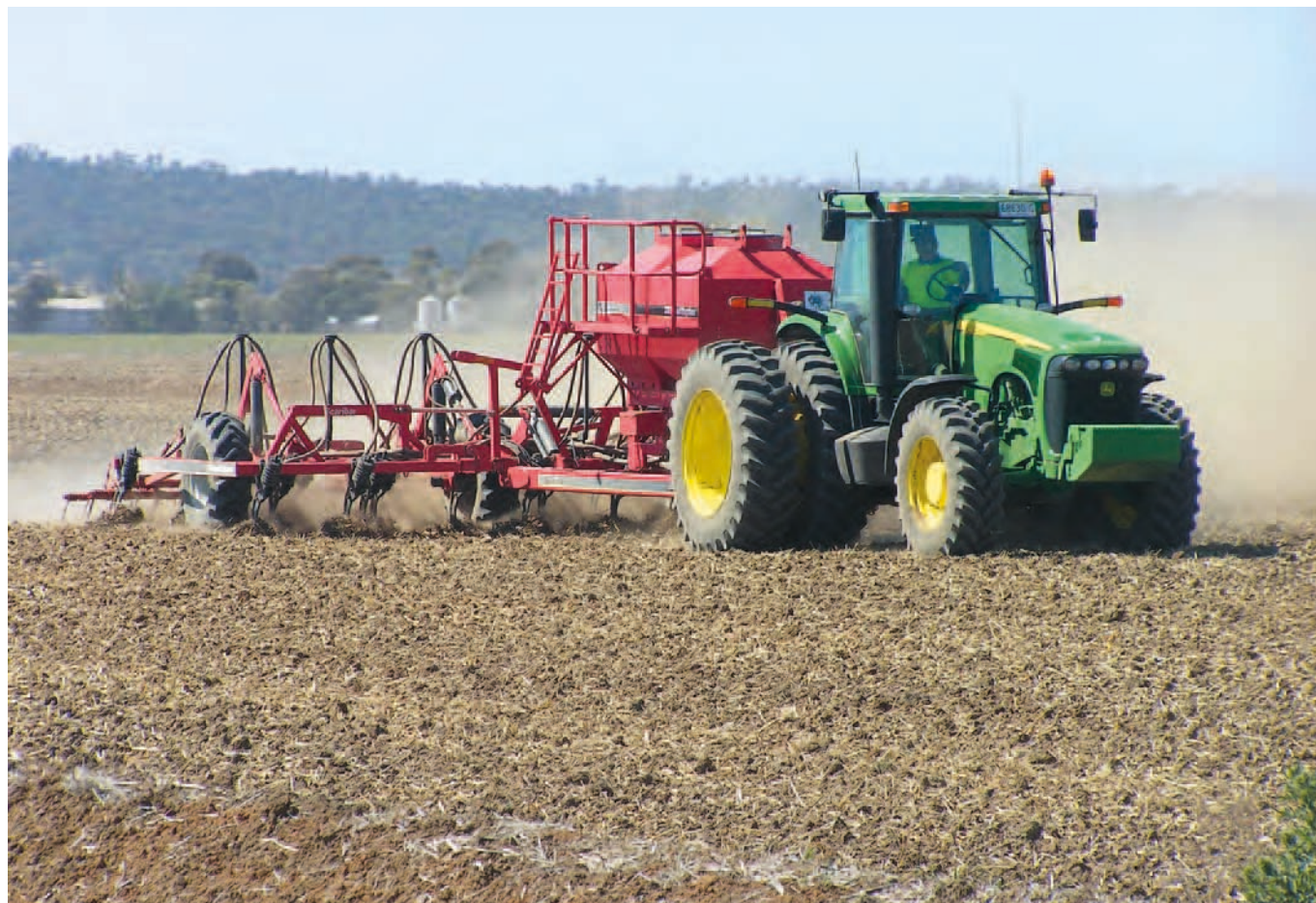
Incorporating nitrogen into the soil prior to application of permanent water is the most efficient way to apply nitrogen when rice is aerial sown.