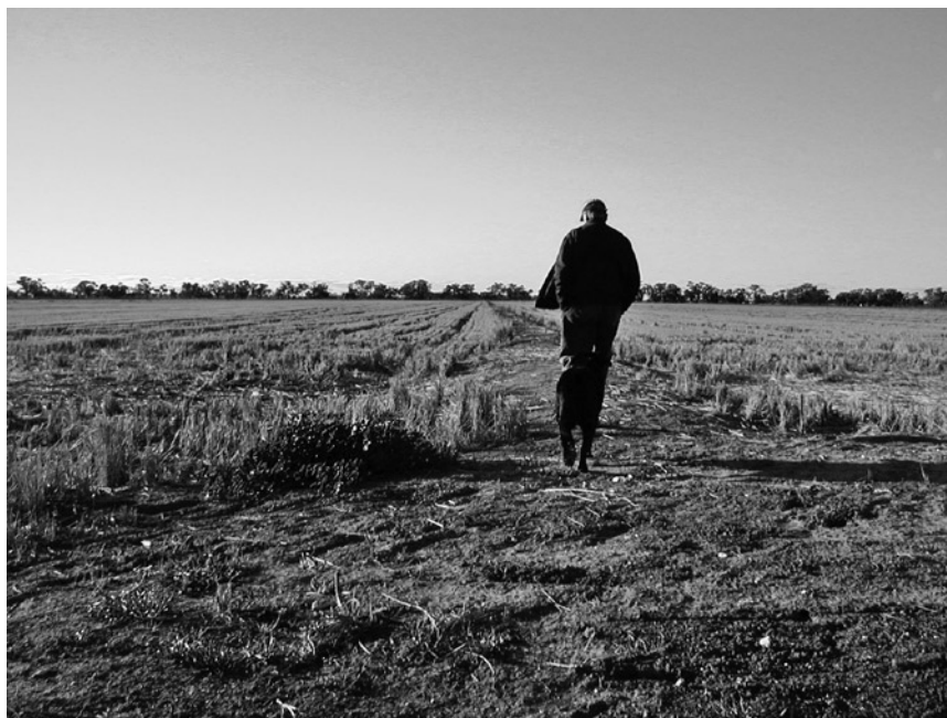
Figure 2. The Kooloos "V-bay" drive over bank seen in profile